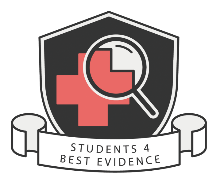
Figure 1 S4BE logo.

S4BE works by bringing together people and resources (S4BE.org). The S4BE web-based community of students seeks to identify evidencebased health care resources, which are then categorised and commented on, pointing out those of most interest and usefulness. The students also promote, discuss and critique evidence-based health care by blogging about the latest evidence on a particular health topic (eg, a recently published systematic review or the importance of economic evaluations in health care) or by explaining evidence-based concepts