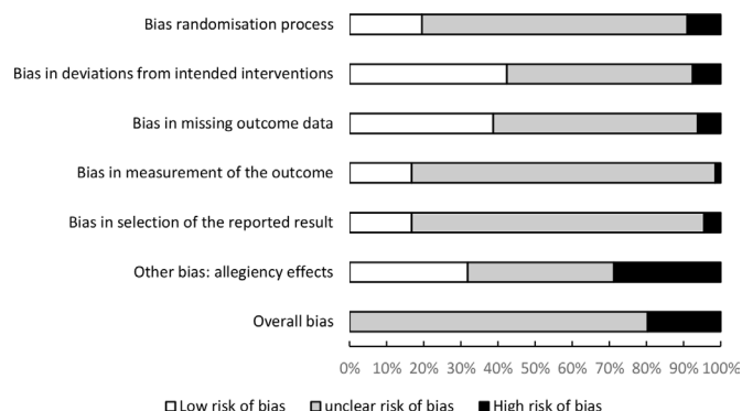
Figure 2 Risk of bias of included studies.